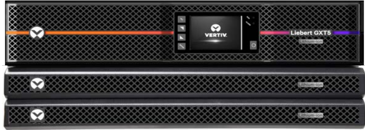
Liebert® GXT5LI 1-3KVA UPS and (2) EBC For Extended Runtime

Lithium-ion technology delivers two to three times the useful life of lead-acid batteries along with a lower total cost of ownership, making the Liebert® GXT5 Lithium-Ion online UPS ideally suited for network and server rooms, and other mission-critical edge applications.