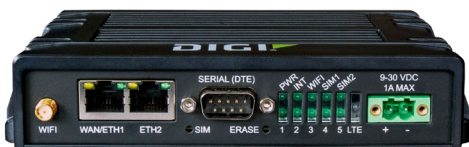
IX20 WITH GPS AND CELLULAR ANTENNAS