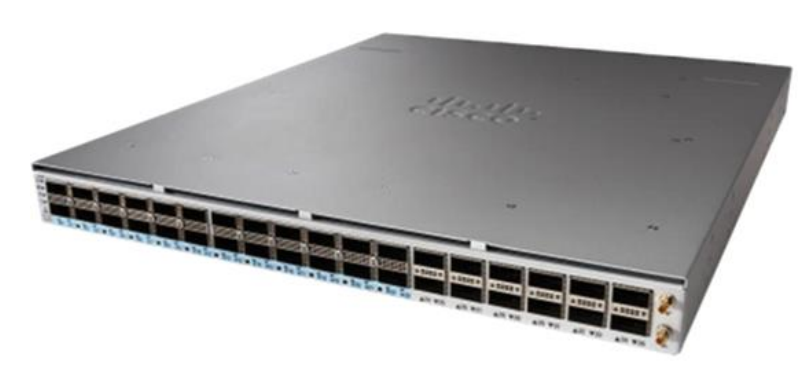
Figure 6. Cisco 8201