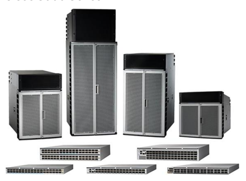
Figure 1. Cisco 8000 Series routers

High-performance networking systems have historically been divided into routing or switching classes, with distinct hardware and software. Over time, this distinction has become less pronounced. This convergence has occurred with the evolution of feature-rich switching chips and routing chips that balance traditional Service Provider (SP)-class capabilities with many benefits of switching Application-Specific Integrated Circuits (ASICs).