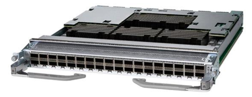
Figure 13. 36-port QSFP56-DD 400GbE line card

The two variants of 36-port QSFP56-DD 400GbE line cards are based on Q100 and Q200 silicon chips. Each line card provides 14.4 Tbps via 36 QSFP56-DD front-panel ports.