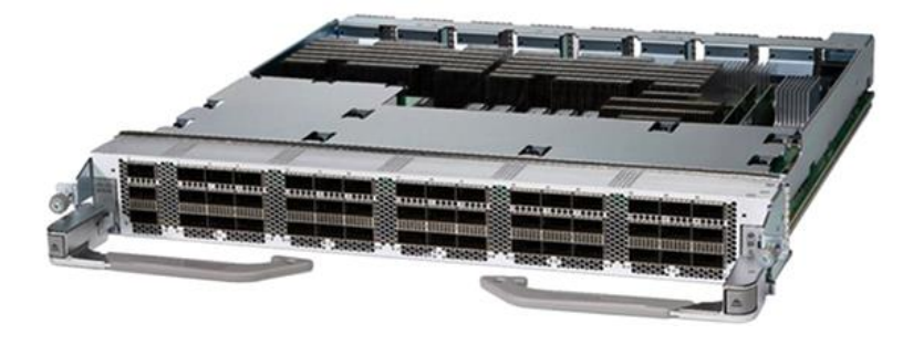
Figure 12. 48-port QSFP28 100GbE line card

The 48-port QSFP28 100GbE line card provides 4.8 Tbps of throughput with MACsec support on all ports. It also supports QSFP+ optics for 10G and 40G compatibility.