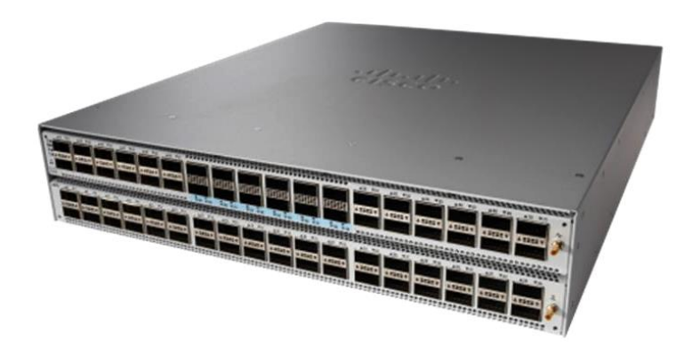
Figure 7. Cisco 8202