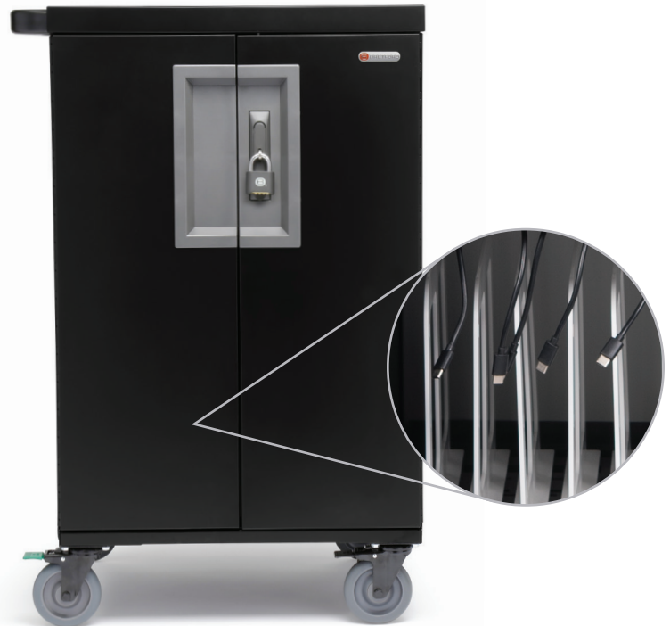
CORE® X Cart Pre-Wired shown in Black Pumice (BP)