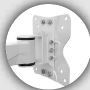
VESA 75x75 / 100x100 Compatible