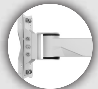
Adjustable Hinge for Portrait & Landscape