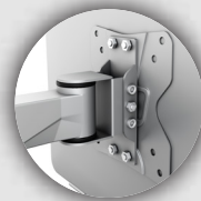
VESA 75x75 / 100x100 Compatible