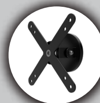
VESA Versatility 75x75 or 100x100