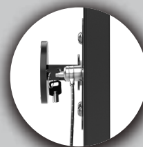
Anti-Theft Cable Lock