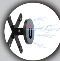
Strong & Sturdy Magnetic Connection