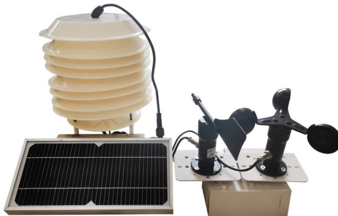
Fig. R72630 Appearance (subject to the actual object)

Wireless Sensor Network Based on LoRa Technology