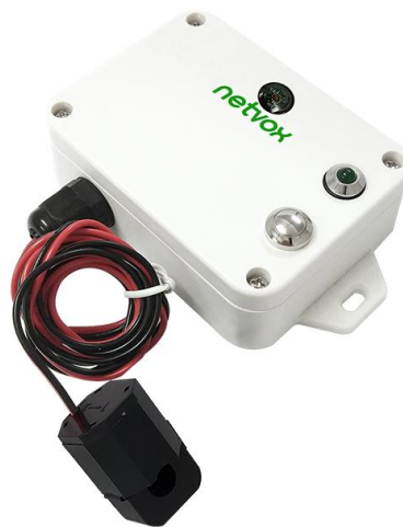
Figure1 R718NL17 Appearance

Wireless Sensor Network Based on LoRa Technology