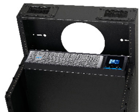
5PX G2 UPS mounted vertically in the MiniRaQ by Eaton, perfect for confined places