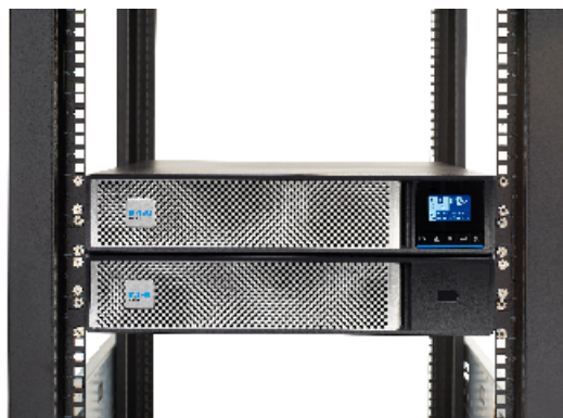
5PX G2 4-post mounting kits are rated (ISTA 3E) to support the weight of a UPS/EBM when mounted in a rack and being transported