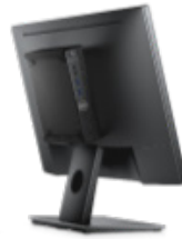
OPTIPLEX MICRO ALL-IN-ONE MOUNT FOR DELL E SERIES MONITORS

Maximize your desk space with this sleek arm that supports both system and monitor mounting.