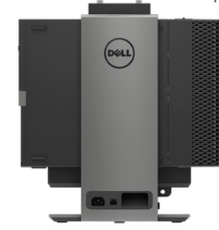
OPTIPLEX SMALL FORM FACTOR ALL-IN-ONE STAND (COMING SOON)

Small footprint mounting solution adapts to your environment, with cable management and monitor height adjustability, tilt, swivel and pivot functions.