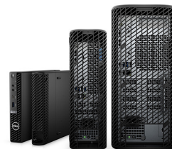
OPTIPLEX CABLE COVERS

Communicate clearly with a headset optimized to provide in-person sound quality, certified for Microsoft Skype for Business.