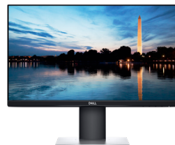
DELL 22 MONITOR - P2219H

23.8" ultrathin bezel optimized for dual display productivity. Easy Arrange feature enables multitasking efficiency and its small base frees valuable workspace.