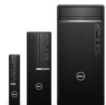
OPTIPLEX DUST FILTERS

Thermally tested custom cable covers offer an easy to install and attractive way to manage cables and secure ports.