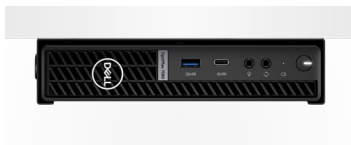
OPTIPLEX MICRO VESA MOUNT WITH ADAPTER BRACKET

Mount your system on a wall or under a surface with a VESA-compatible DVD+/-RW enclosure with full optical drive access. Includes an adapter box to securely house the system's power adapter.