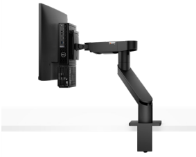
DELL SINGLE MONITOR ARM - MSA20

Maximize your desk space with this sleek arm that supports both system and monitor mounting.