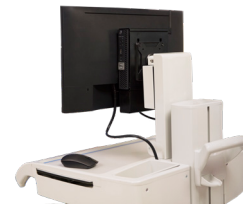
OPTIPLEX MICRO DUAL VESA MOUNT WITH ADAPTER BRACKET

This mount allows the Micro to be VESA mounted to select Dell E Series displays.