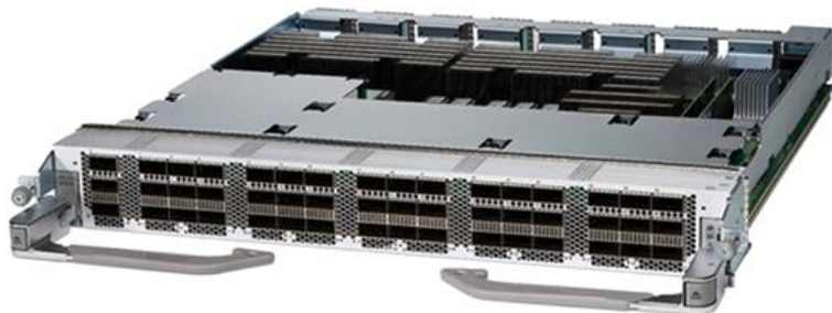
Figure 12. 48-port QSFP28 100GbE line card

The 48-port QSFP28 100GbE line card provides 4.8 Tbps of throughput with MACsec support on all ports. It also supports QSFP+ optics for 10G and 40G compatibility.