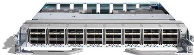
Figure 16. 34 - port QSFP28 100GbE and 14 - port QSFP56-DD 400GbE

In addition, there is a combo card that provides 34 - QSFP28 100GbE and 14 - QSFP56-DD ports. It offers customers the ability to smoothly transition from 100G to 400G. For additional flexibility, this card supports MACsec on 16 of the 100GbE ports.