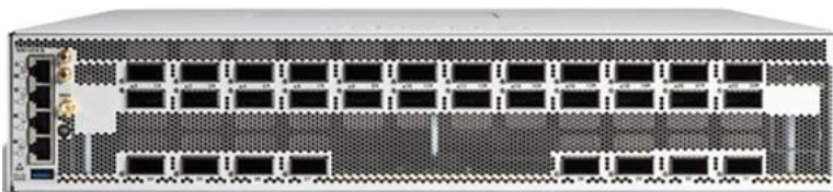
Figure 10. Cisco 8202-32FH-M

The Cisco 8200 Series is designed for roles requiring higher scale and external deep buffers. To achieve similar routed bandwidth and scale, other industry routers require multiple devices such as off-chip Ternary Content-Addressable Memory (TCAMs), fabric ASICs, and multiple network processors. However, the Cisco 8200 Series routers use a simple single ASIC (with HBM) design without the need for off-chip TCAM.