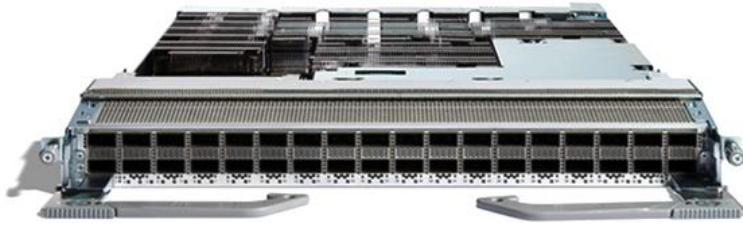
Figure 15. 36-port QSFP-DD800 800G line card

In addition, there is a combo card that provides 34 - QSFP28 100GbE and 14 - QSFP56-DD ports. It offers customers the ability to smoothly transition from 100G to 400G. For additional flexibility, this card supports MACsec on 16 of the 100GbE ports.