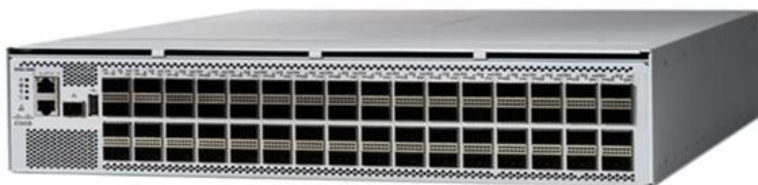
Figure 3. Cisco 8102-64H-O