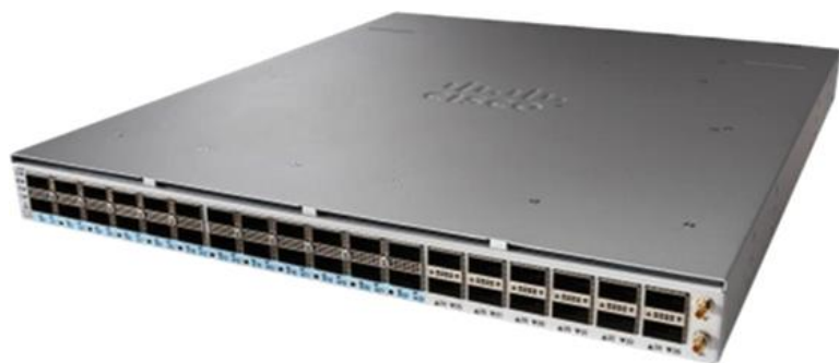
Figure 6. Cisco 8201-SYS