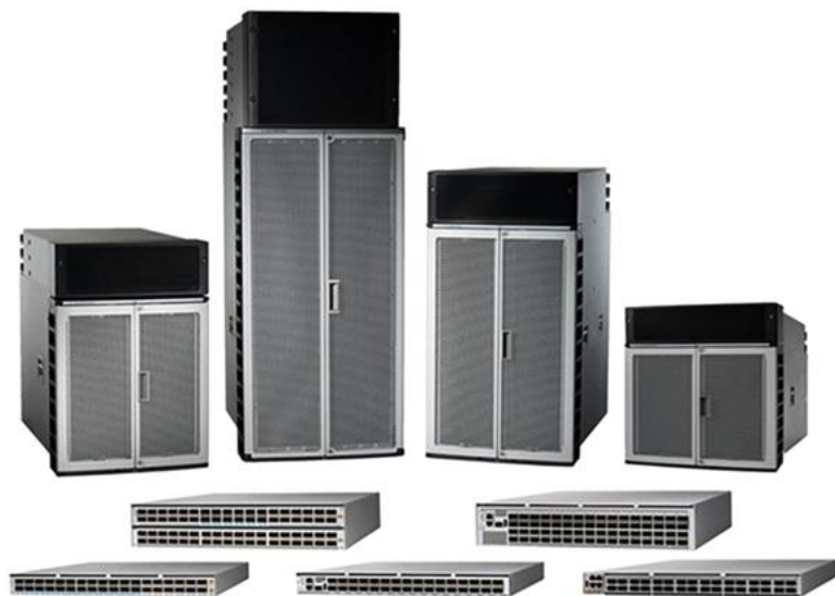
Figure 1. Cisco 8000 Series routers

High-performance networking systems have historically been divided into routing or switching classes, with distinct hardware and software. Over time, this distinction has become less pronounced. This convergence has occurred with the evolution of feature-rich switching chips and routing chips that balance traditional Service Provider (SP)-class capabilities with many benefits of switching Application-Specific Integrated Circuits (ASICs).