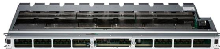
Figure 17. Cisco 8800 fabric card

The Cisco 8800 Series switch fabric is powered by 8 fabric cards that provide 7+1 line rate redundancy. In addition, the fabric supports a separate operational model with 4+1 fabric card redundancy to provide an entry level option for systems with only the 48-port 100GbE line card. This mode reduces cost and power for networks that want to take advantage of the latest platforms but are not yet ready to broadly deploy 400GbE.