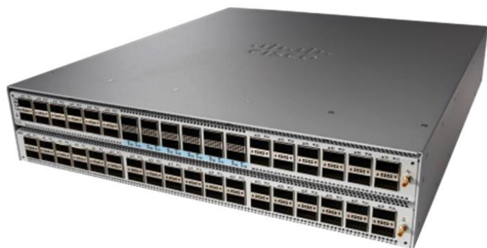
Figure 7. Cisco 8202-SYS