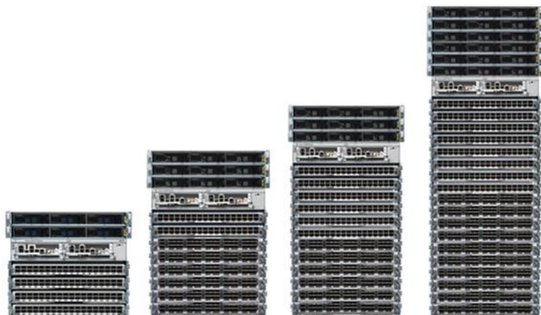
Figure 11. Cisco 8800 4-, 8-, 12-, and 18-slot modular chassis

With up to 518.4 Tbps via 648 800G (2x 400GbE) ports, the Cisco 8800 Series delivers industry leading breakthrough density and efficiency with the extensive scale, buffering, and feature capabilities common to all the Cisco 8000 Series of routers. It includes four chassis - the 8804, 8808, 8812, and 8818 - to meet a broad set of network and facility requirements.