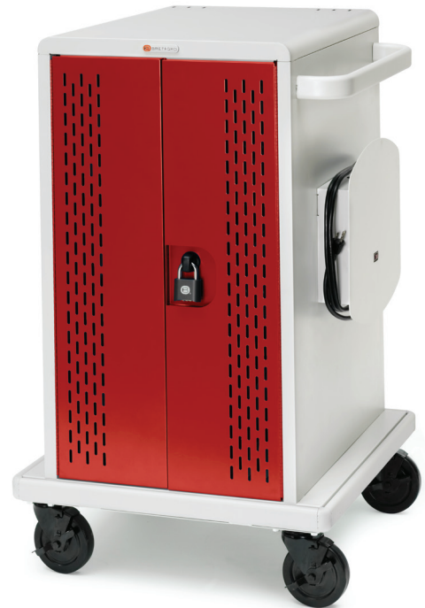
CORE® M Cart shown in Arctic White (AC) with Red doors

Keep Chromebooks, laptops and tablets charged and ready to go. The Core® M Charging Cart features a sleek customizable two-tone design, smart charging across devices, a secure locking system and world-class reliability.