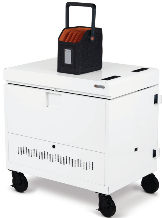
CUBE Toploader™ Cart with Caddies shown in Arctic White (AW)

Quickly and safely deploy devices in the classroom with the CUBE Toploader™ Cart with Caddies. Keep Chromebooks, laptops and tablets, up to 13 in., charged and ready to go. This solution comes with 6 caddies to support up to 30 devices.