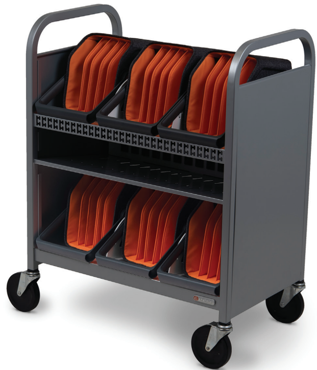
CUBE Transport® Cart with Caddies shown in Platinum (PM)

Charge, store, and quickly distribute up to 30 devices with the CUBE Transport® Cart with Caddies. This solution comes with 6 Caddies and supports Chromebooks, laptops, and tablets up to 13 in.