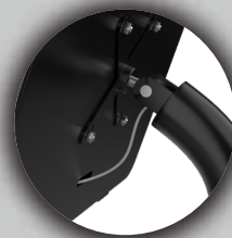
Efficient Cable Routing