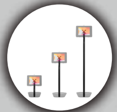
Three Height Size Setups