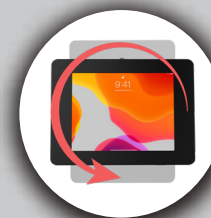
Portrait to Landscape