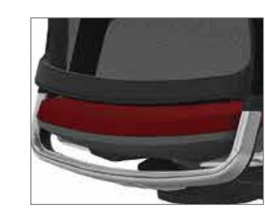
Polished aluminum accents give the Luna task a touch of luxury in a chair built for versatility.