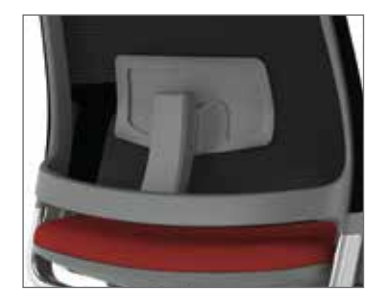
Luna task chairs and stools feature an optional height-adjustable lumbar for additional back support.