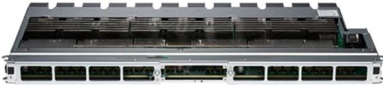
Figure 17. Cisco 8812 fabric card

The Cisco 8800 Series switch fabric is powered by 8 fabric cards that provide 7+1 line rate redundancy. In addition, the fabric supports a separate operational model with 4+1 fabric card redundancy to provide an entry level option for systems with only the 48-port 100GbE line card. This mode reduces cost and power for networks that want to take advantage of the latest platforms but are not yet ready to broadly deploy 400GbE.