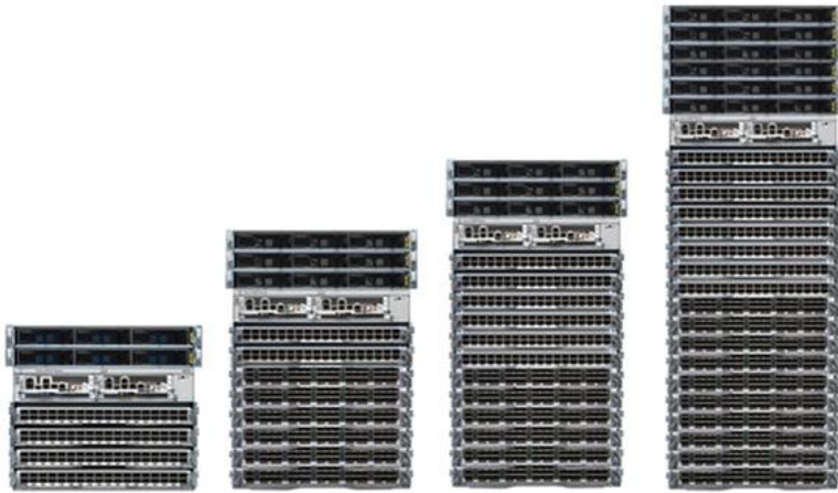
Figure 11. Cisco 8800 4-, 8-, 12-, and 18-slot modular chassis

With up to 518.4 Tbps via 648 800G (2x 400GbE) ports, the Cisco 8800 Series delivers industry leading breakthrough density and efficiency with the extensive scale, buffering, and feature capabilities common to all the Cisco 8000 Series of routers. It includes four chassis – the 8804, 8808, 8812, and 8818 – to meet a broad set of network and facility requirements.