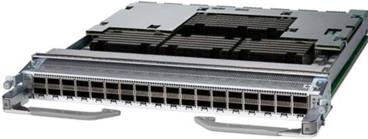
Figure 13. 36-port QSFP56-DD 400GbE line card

The two variants of 36-port QSFP56-DD 400GbE line cards are based on Q100 and Q200 silicon chips. Each line card provides 14.4 Tbps via 36 QSFP56-DD front-panel ports.