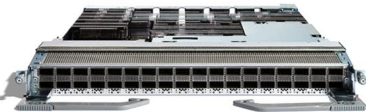
Figure 15. 36-port QSFP-DD800 800G line card

The 36-port QSFP-DD800 800G line card provides 28.8 Tbps of throughput. Each 800G port can be used as 2x400GbE ethernet or 8x100GbE ethernet.