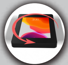
Portrait and Landscape Orientations