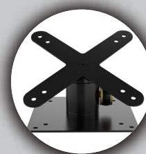
Versatile VESA Mount