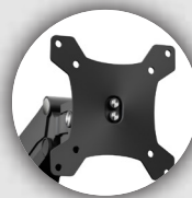
VESA Capable 75mm x 75mm 100mm x 100mm