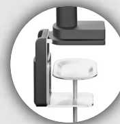
Sturdy C-Clamp Mount