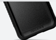
APDT™ AIR POCKET DAMPENING TECHNOLOGY