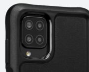
FULL CAMERA, BUTTON & PORTS FUNCTIONALITY