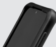
RAISED FRONT BEVEL