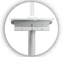
Multi-purpose compartment storage