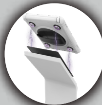
Strong Magnetic Mounting Connection

This combination premium locking floor stand and removeable magnetic case is ideal for presentations, conference rooms, lobbies, and any place that requires a secure iPad station. The rugged, military grade tablet case is splash-proof, impact-resistant, and comes with a screen protector. Powerful embedded magnets at its rear to enable instant mounting to metal surfaces – letting you switch from floor stand to refrigerator, or metal wall surfaces. The case is designed to allow full access to your tablet's ports, speakers, and home button. CTA's premium locking floor stand is a workhorse. Standing 50 inches tall, this heavy-duty floor stand boasts a hollow interior for clean charge cable routing, plus a weighted base equipped with slip and scratch resistant padding. The case is compatible with iPad 7th & 8th Gen 10.2", iPad Air 3 and 4, iPad Pro 10.5", and more.