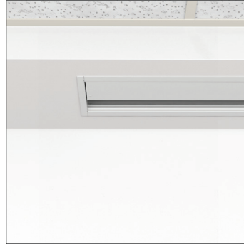
In Ceiling (Closed)