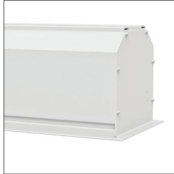
Case Profile - Sizes Over 14' W