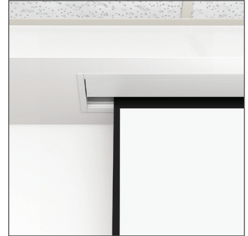
In Ceiling (Open)