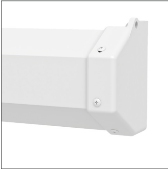
White Case (Standard)