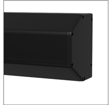
Black Case - Over 12" W