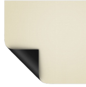
Video Spectra 1.5