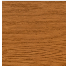
Medium Oak Veneer