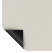
High Contrast Matte White