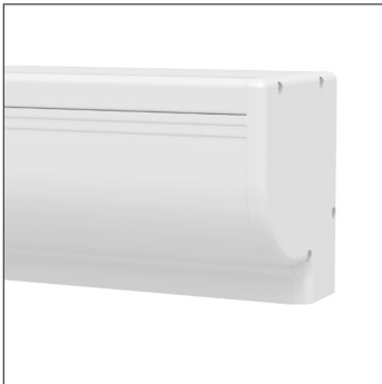
White Case (Standard)