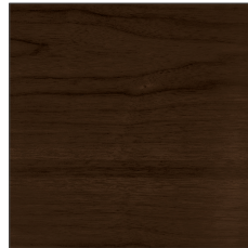
Heritage Walnut Veneer