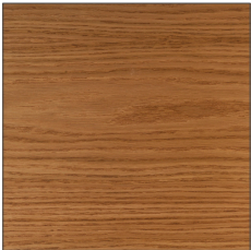
Light Oak Veneer