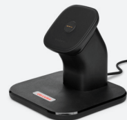
OPTIONAL BOLT® CHARGING STAND AVAILABLE