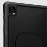
FULL CAMERA, BUTTON & PORTS FUNCTIONALITY