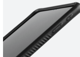
RAISED FRONT BEVEL