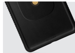
APDT™ AIR POCKET DAMPENING TECHNOLOGY