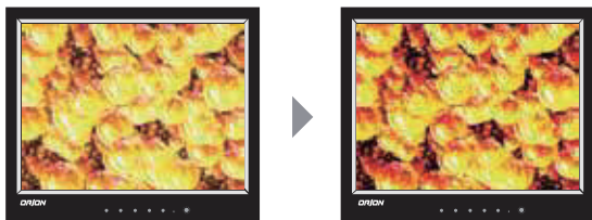
Before 3D Comb Filter

In signal processing, a comb filter adds a delayed version of a signal to itself, causing constructive and destructive interference. The frequency response of a comb filter consists of a series of regularly-spaced spikes, giving the appearance of a comb.