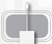
Lenovo USB-C 3-in-1 Hub