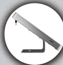
Sleek Design for Comfortable Use