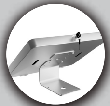
Fast & Simple Installation bolted or unbolted