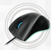
Lenovo Legion M500 RGB Gaming Mouse

* Example of Lenovo catalogue naming convention