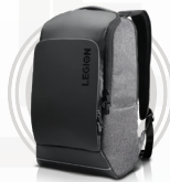
Lenovo Legion 15.6" Recon Gaming Backpack