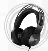
Lenovo Legion H500 Pro 7.1 Surround Sound Gaming Headset