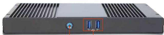
Power Button USB 3.0 x 2