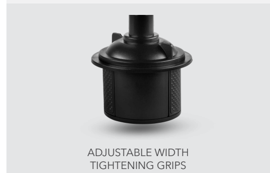
ADJUSTABLE WIDTH TIGHTENING GRIPS