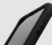
RAISED FRONT BEVEL