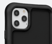
FULL CAMERA, BUTTON & PORTS FUNCTIONALITY