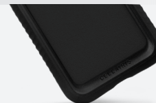
APDT™ AIR POCKET DAMPENING TECHNOLOGY