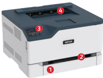
Xerox® C230 Colour Printer