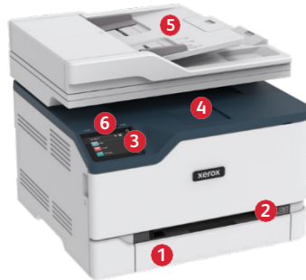
Xerox® C235 Colour Multifunction Printer