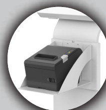
Universal Holder Storage