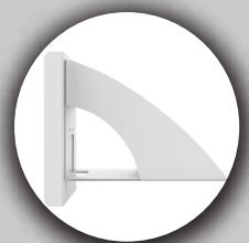
Space Saving and Compact