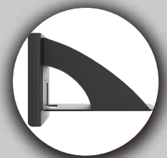
Space Saving and Compact