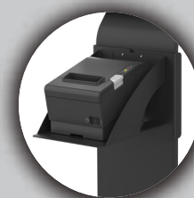
Universal Holder Storage