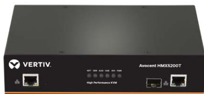
Avocent® HMX 5200T