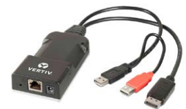
Avocent® HMX 6150T-DP