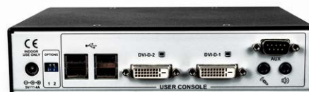
Avocent® HMX 6200R