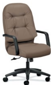
HIGH-BACK CHAIR FEATURES MEMORY FOAM