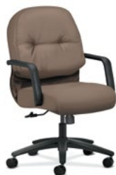
MID-BACK CHAIR FEATURES MEMORY FOAM