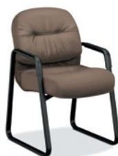
SLED BASE GUEST CHAIR