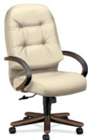
HIGH-BACK CHAIR FEATURES MEMORY FOAM