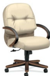
MID-BACK CHAIR FEATURES MEMORY FOAM