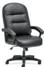
HIGH-BACK CHAIR (Limited fabrics only)