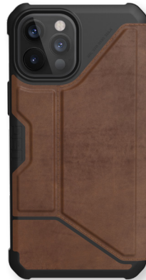
LTHR ARMR- BROWN SKU // 112366118380 UPC // 812451037326

MADE WITH FIBR ARMR COMBINES A DROP TESTED ARMOR SHELL WITH HIGH STRENGTH ABRASION RESISTANT FABRICS.