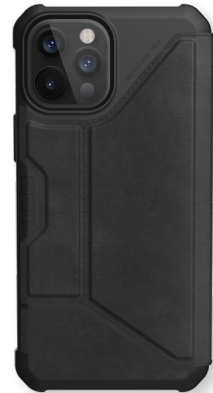
LTHR ARMR- BLACK SKU // 112366118340 UPC // 812451037333

MADE WITH LTHR ARMR COMBINES DROP TESTED ARMOR SHELL WITH PREMIUM ITALIAN LEATHER.