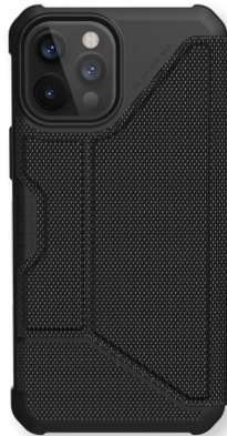
FIBR ARMR- BLACK SKU // 112366113940 UPC // 812451037319

MADE WITH SATN ARMR COMBINES A DROP TESTED ARMOR SHELL WITH A SMOOTH SATIN FINISH EXTERIOR