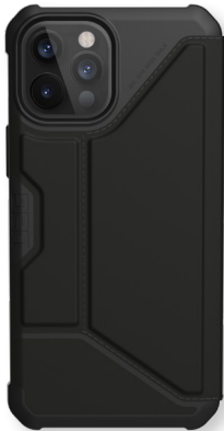
SATN ARMR- BLACK SKU // 112366113840 UPC // 812451037302

MADE WITH SATN ARMR COMBINES A DROP TESTED ARMOR SHELL WITH A SMOOTH SATIN FINISH EXTERIOR