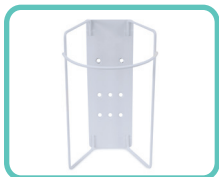
T-SLOT WIPES HOLDER 98-450