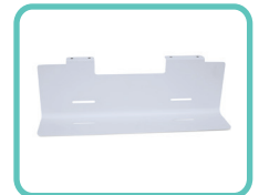
FRONT SHELF, SLIM 2.0 98-476

Download additional resources at ergotron.com .