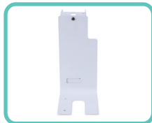
SIDE-MOUNT SCANNER BRACKET, SLIM 2.0 98-467