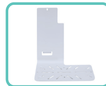
SIDE-MOUNT WIRELESS SCANNER BRACKET, SLIM 2.0 98-466