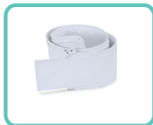
VINYL CORD COVER KIT 98-453