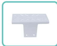
T-SLOT SCANNER AND PRINTER HOLDER 98-465