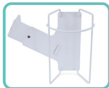
SIDE-MOUNT WIPES HOLDER, SLIM 2.0 98-451