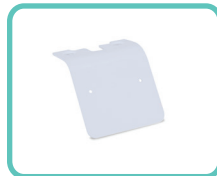
SIDE-MOUNT PRINTER BRACKET, SLIM 2.0 98-468