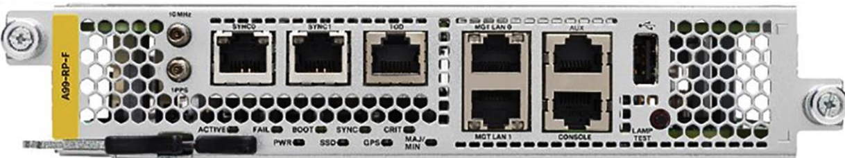
Figure 2. Cisco ASR 9903 Route Processor