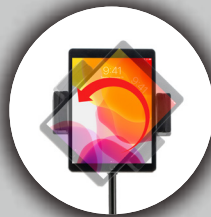
Quick-Connect Feature for Handheld or Stand Mount Positions

This streamlined and heavy-duty floor stand gives you quick, easy setups at any business or home environments. The floor stand central base is equipped with four commercial grade lockable casters, perfect for hospitals and doctor's offices. Counting with omni-directional angle, height adjustment and 360-degree rotation, the tablet holder also rotates 360 degrees to accommodate portrait and landscape orientations. The quick-connect mechanism detaches the tablet holder from the stand with a simple squeeze. This allows you to switch between handheld and mounted modes without having to remove your tablet from the holder or from the floor stand. The resizable holder and additional add-on pads are designed to allow full access to your tablets, ports, buttons, and jacks, and accommodate virtually any tablet model.