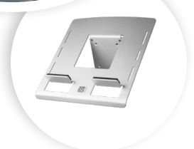
R-GO MORELIA LAPTOP HOLDER