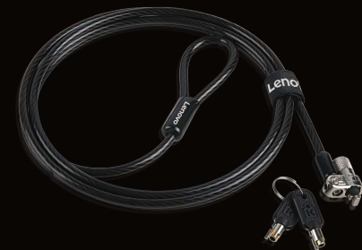
Kensington Microsaver ▶ 2.0 Cable Lock