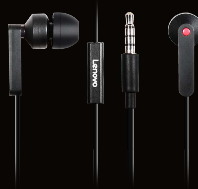
◀ Lenovo In-Ear Headphones