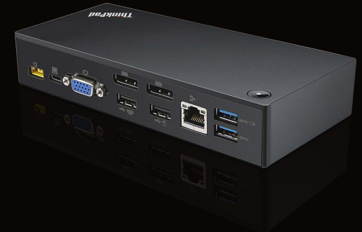
ThinkPad USB-C Dock ▶