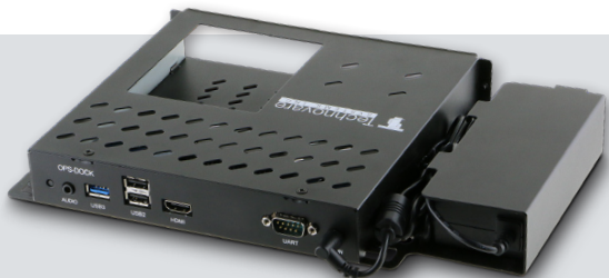
*OPS-DOCK is an accessory and is not included with any version of the OPS.