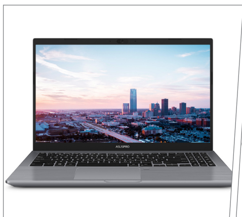
Slim NanoEdge display