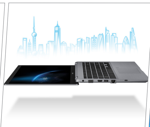
180° lay-flat hinge