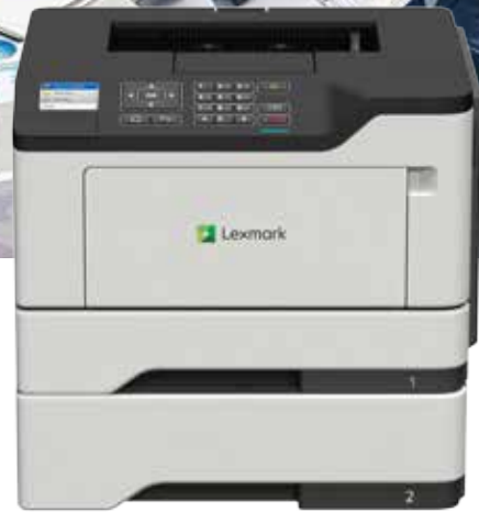
MS521dn with optional trays