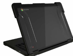
Models: NL71T, NL71T-X2